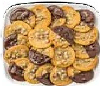
Ultimate Chocolate Chip Cookie Tray