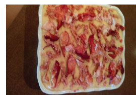
Lobster Mashed Potatoes