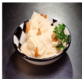
Garlic Mashed Potatoes