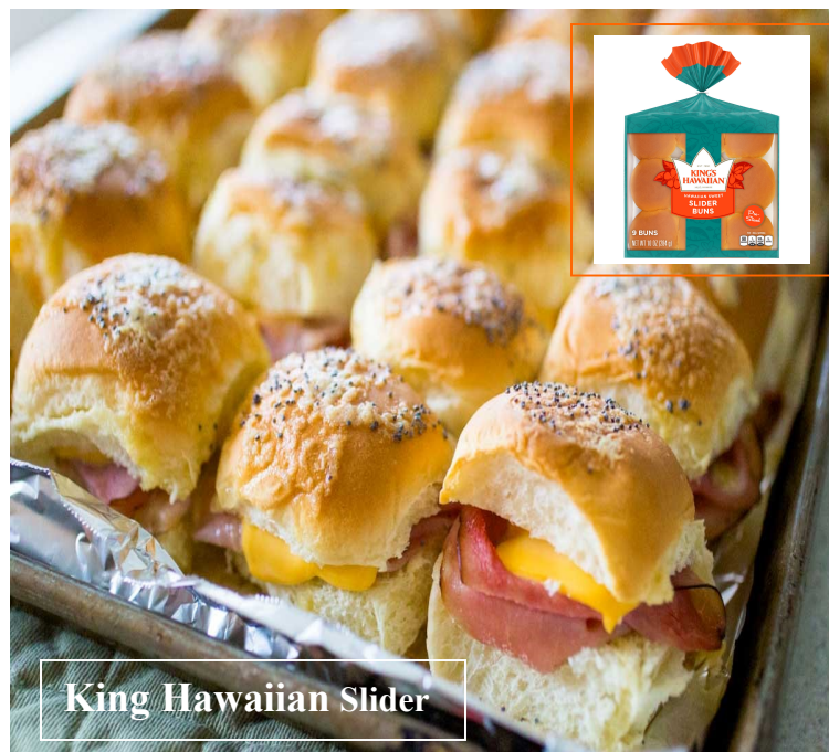
King Hawaiian Slider