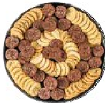
Cookie and bite-size Brownie Tray