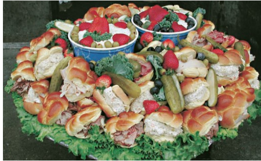
Mini Roll Sandwich

Includes: POTATO SALAD • COLE SLAW • OLIVES • PICKLES • CHIPS