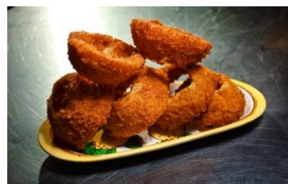
Colossal Onion Rings