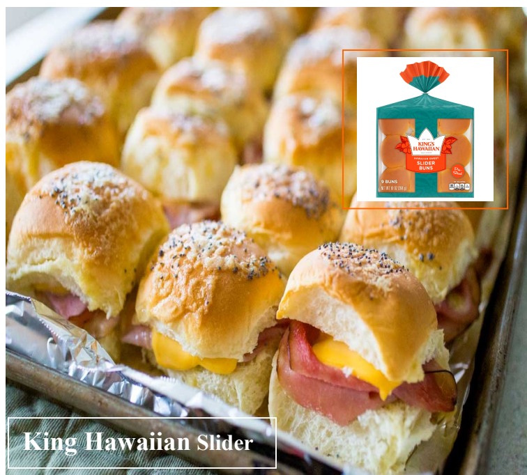
King Hawaiian Slider