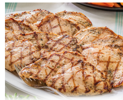
Grilled Lemon Garlic Chicken