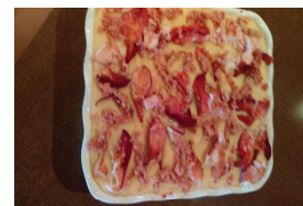
Lobster Mashed Potatoes