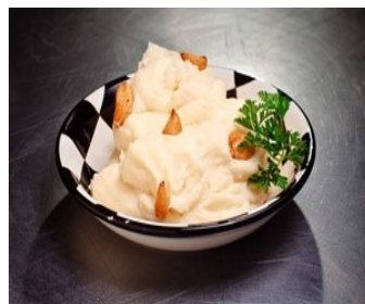
Garlic Mashed Potatoes