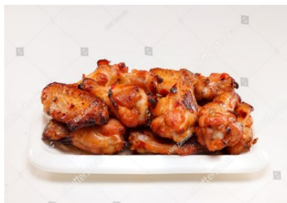
BQQ Wing Dings