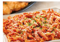
Penne Seasoned In Tomato sauce