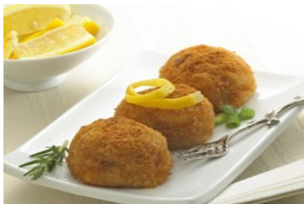
Mini Crab Cake