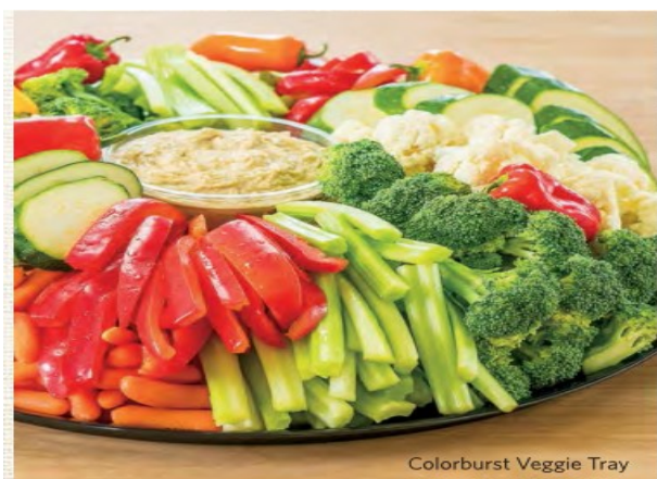
Colorburst Veggie Tray

MEDIUM SERVES 16-20 . $75.00 LARGE SERVES 24-30 ... $95.00