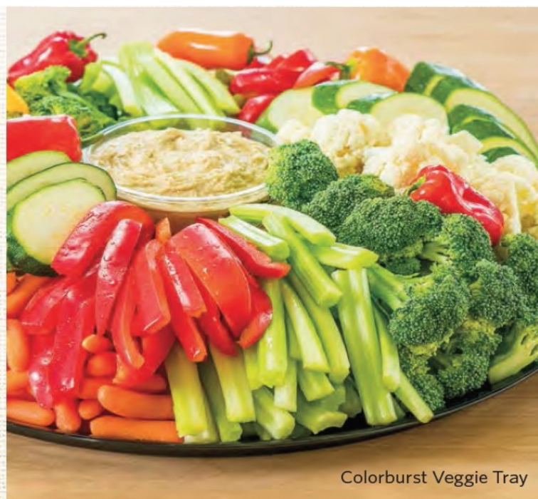
Colorburst Veggie Tray