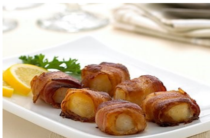
Bacon Wrapped Scallops