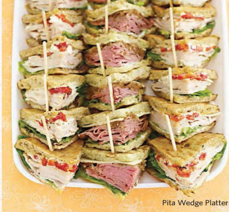
Pita Wedge Platter