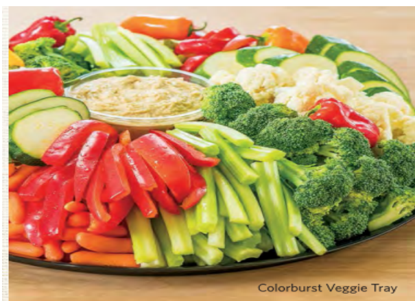
Colorburst Veggie Tray

MEDIUM SERVES 16-20 .....$65 LARGE SERVES 24-30 .....$85