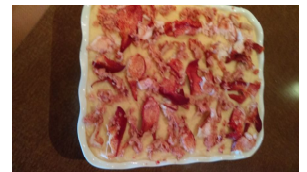
Lobster Mashed Potatoes