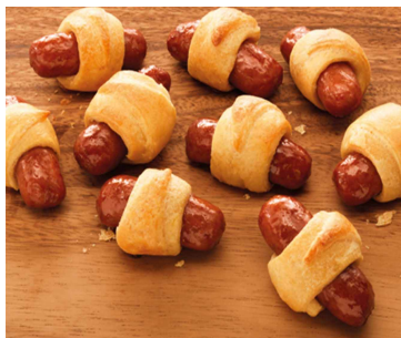
Pigs in a Blanket