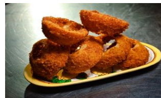
Colossal Onion Rings