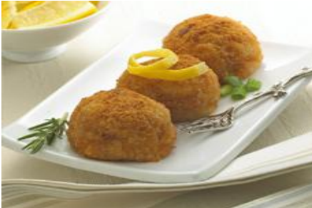
Mini Crab Cake