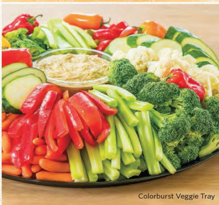
Colorburst Veggie Tray