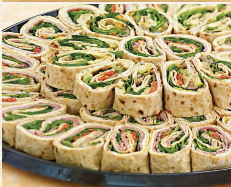
Signature Wheat Wrap Tray