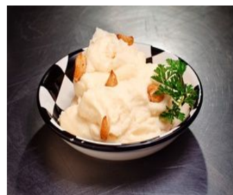
Garlic Mashed Potatoes