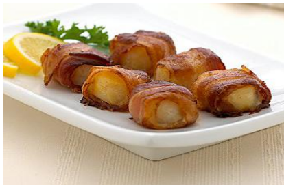
Bacon Wrapped Scallops