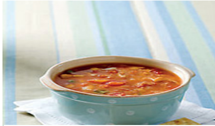
Manhattan Clam Chowder