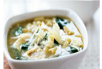
Spinach Chicken Noodle