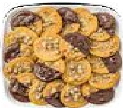
Ultimate Chocolate Chip Cookie Tray

SMALL SERVES 12(24 Cookies)...$45.00 LARGE SERVES 24(48 Cookies)...$85.00