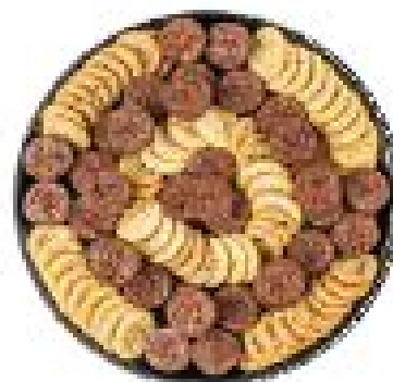
Cookie and bite-size Brownie Tray

SMALL SERVES 12(24 Cookies)...$45.00 LARGE SERVES 24(48 Cookies)...$85.00